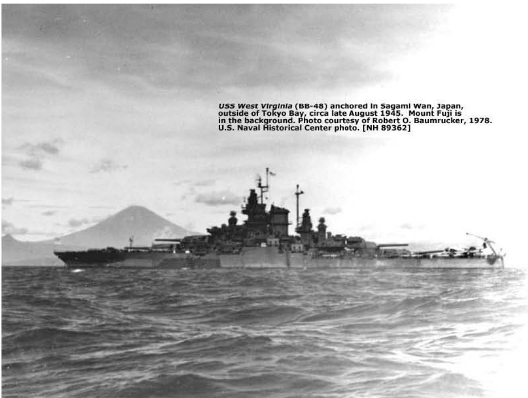
USS West Virginia (BB-48) anchored in Sagami Wan, Japan, outside of Tokyo Bay, circa late August 1945. Mount Fuji is in the background. [NH 89362]