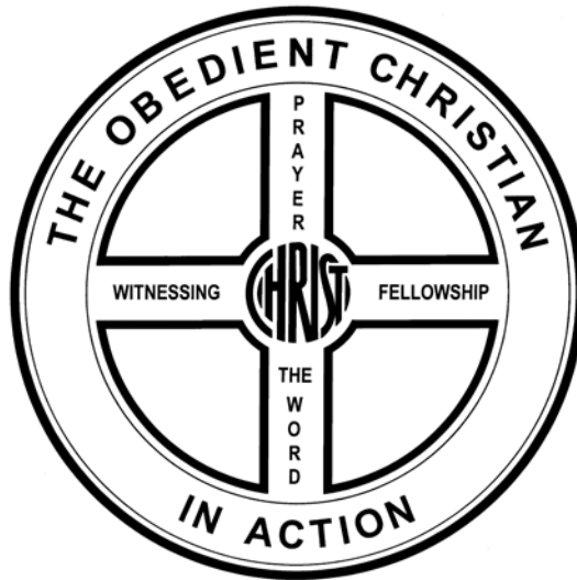
The Wheel Illustration